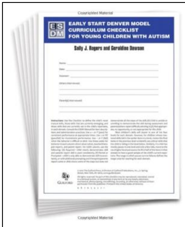
Filesize: 7.31 MB